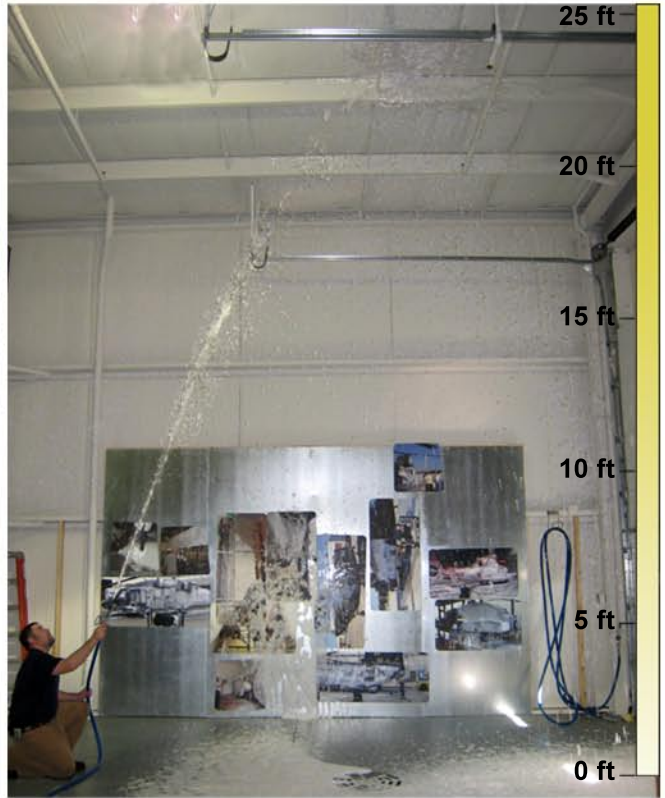
Vertical Throw with FloJet Pump (25 ft or 8 M)

The 25 gallon foamers come standard with a FloJet pump. This AAOD pump includes standard Santoprene seals (also available in Viton), 7gpm (26.5 Lpm), and a one year warranty. We also have this unit available with a Versamatic 3/8 inch pump if you prefer.